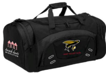
Sports bag $75