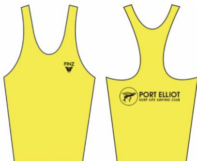
Hi Vis Vest – $20