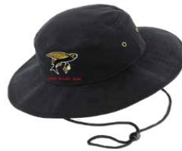
Hat – surf style with chin strap $25