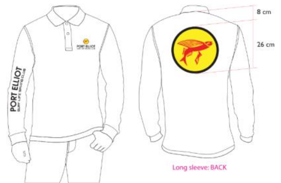
long sleeve for junior carnivals $45