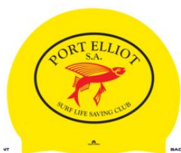
Silicone swim cap $15