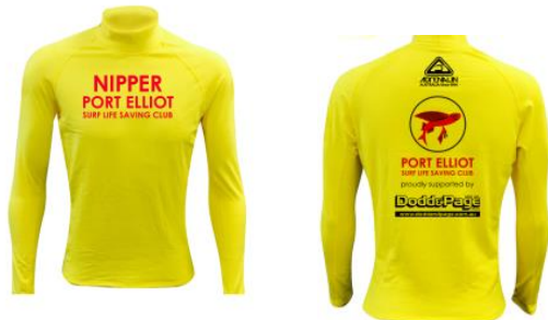
Nipper Yellow Rash Vest $40