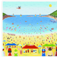
PORT ELLIOT SURF LIFE SAVING CLUB Horsehoe Bay, Port Elliot "THE CASINO" Illustration by: Howard Sharp